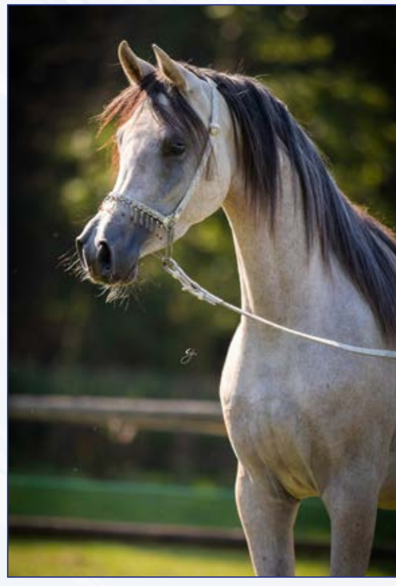
ASE KONOOZ Hariry al Shaqab | Stig Ashirafa.